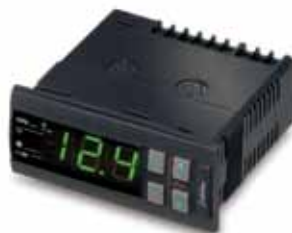
Micro Chiller II

The standard Motivair microprocessor controller is a very powerful, yet user-friendly device. It offers a wide range of standard controls and alarms to suit any chiller application. It can control up to 4 stages of cooling in the chiller. Optional communication features include a serial card connection to a remote PC and a full-feature, remote wall-mounting controller, connected via an RS485 cable up to 500 feet away. For those applications requiring up to 8 cooling stages, and/or a higher level of remote communication, the PC03 advanced PLC system is available from the MPC 2200 and above.