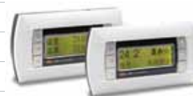
Wall Mount Controller