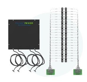
Branch circuit monitoring

Easily add monitoring to existing panels, PDUs and RPPs. Fits in even the tightest panel.